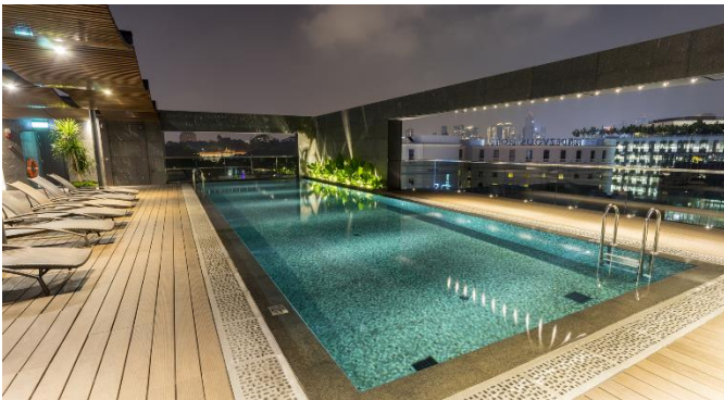
(Night view of swimming pool)

Guests can also opt for rooms with an outdoor balcony for their own private alfresco dining experience. Free WiFi throughout the hotel (only a single login is required), a Handy Phone which provides access to free local and international calls to six countries, a master switch for each room and a self- laundry service are among the many features that target today’s tech and mobile savvy guests.