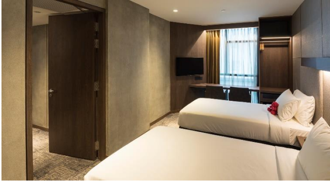
(Family Room with two ensuite bathrooms)