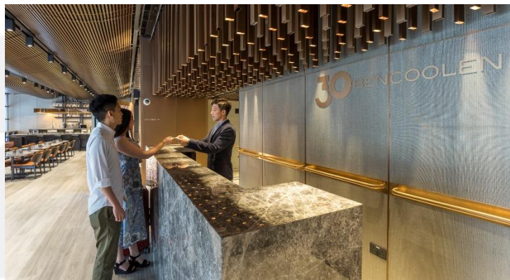
(Hotel lobby of 30 Bencoolen)

The Hotel's transformation has also achieved Singapore's first hotel in harnessing the power of IoT, seamlessly connecting guest rooms with the operations team to deliver a