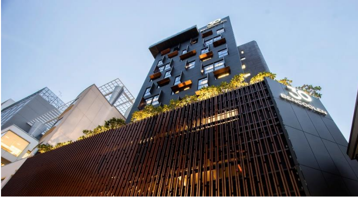
(Façade of 30 Bencoolen)

Centrally located within the vibrant Arts & Cultural district in downtown Singapore, the hotel is a short stroll away from 3 MRT stations (Bras Basah, Dhoby Ghaut and Bencoolen), major attractions and malls. A welcoming respite along the car-lite Bencoolen Street, 30 Bencoolen offers a myriad of options to discerning travelers and locals beyond the locale's arts and culture experiences, in a highly walkable and people-friendly environment.