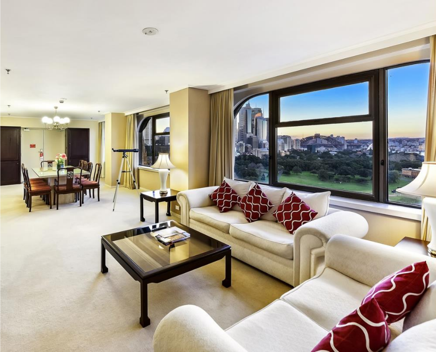
PRESIDENTIAL SUITE LIVING ROOM