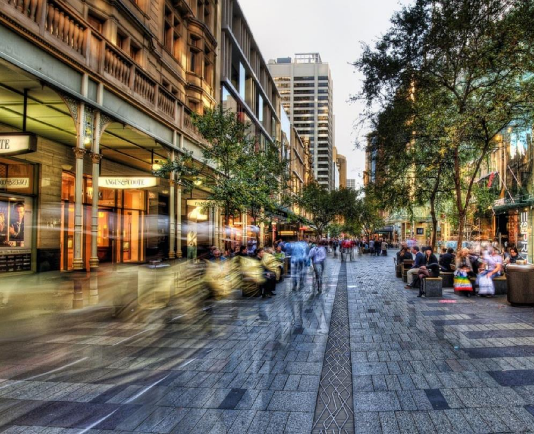
PITT STREET MALL