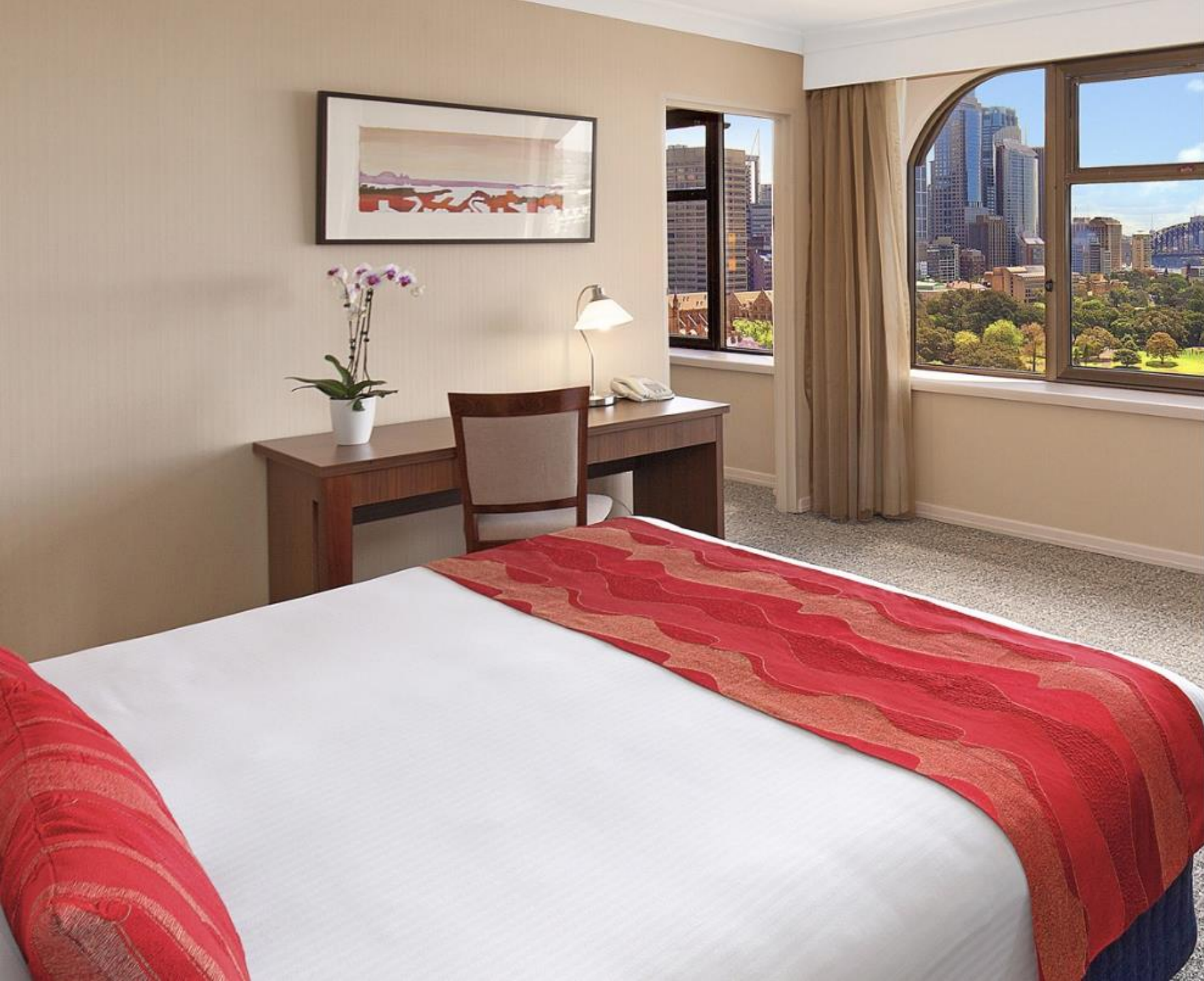
EXECUTIVE HARBOUR VIEW SUITE