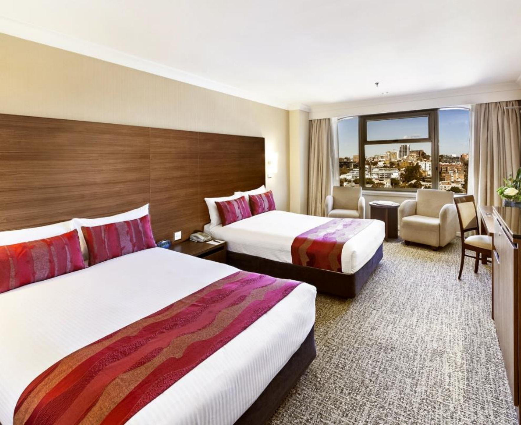
DELUXE TWIN CITY VIEW