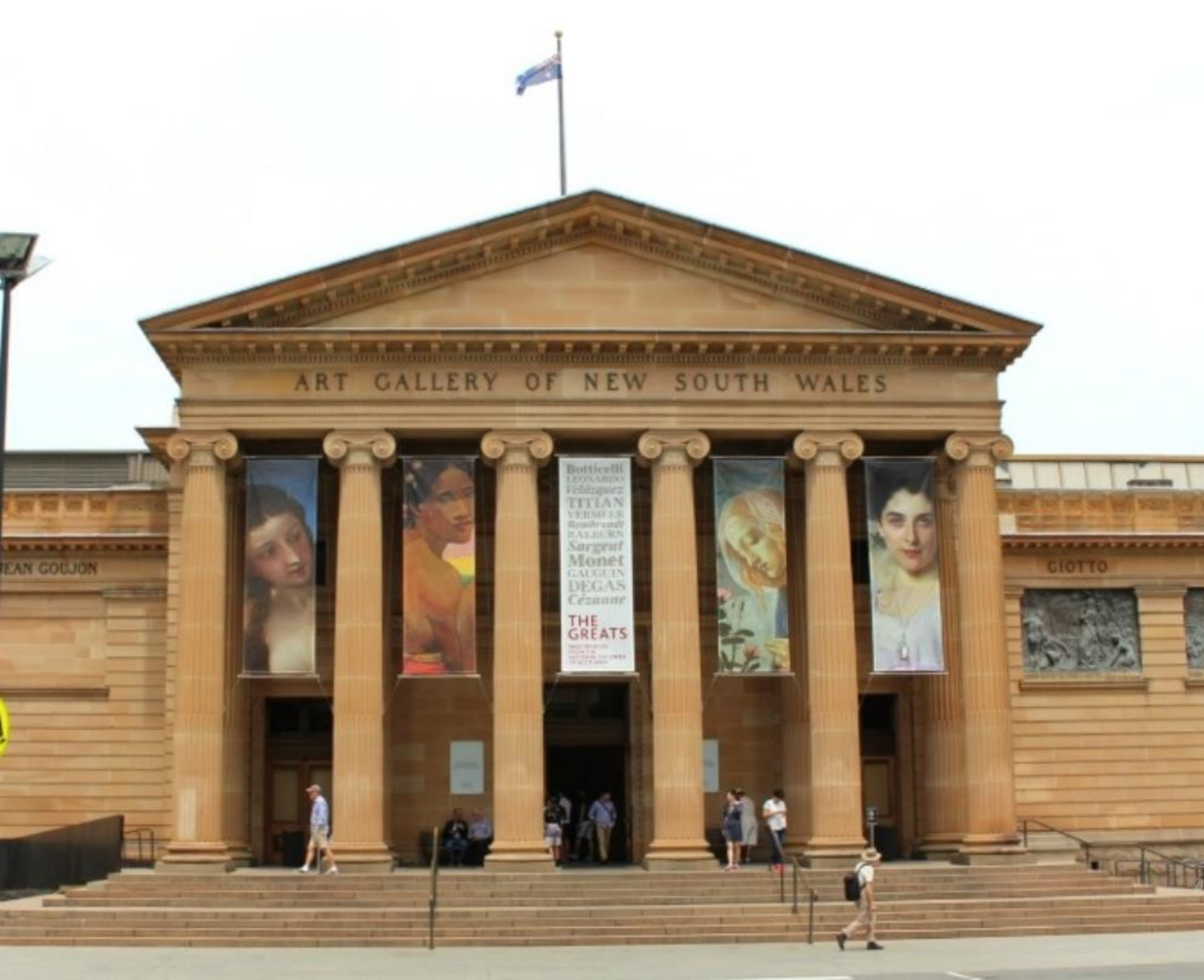
ART GALLERY OF NSW