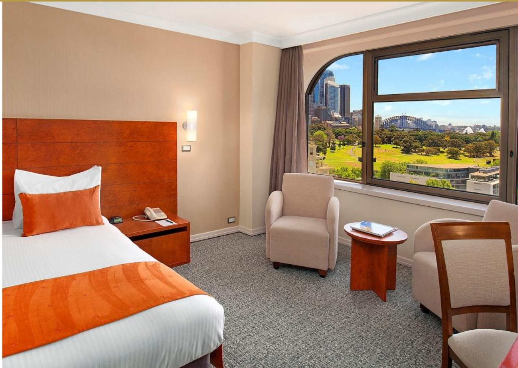
STANDARD KING HARBOUR VIEW