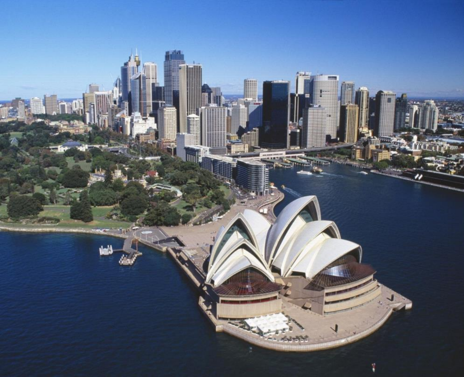
SYDNEY OPERA HOUSE